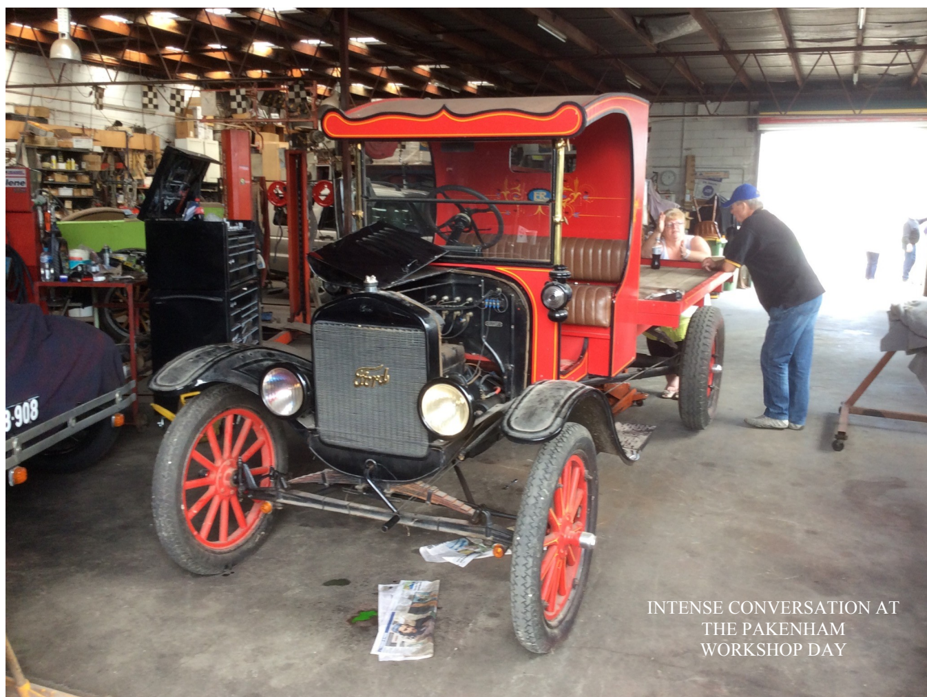
INTENSE CONVERSATION AT THE PAKENHAM WORKSHOP DAY

Updated policy for Club Permitted Vehicles, Internet links, Scoresby Picnic, 2016 Rally update, Workshop day photos, Garage crawl photos and all the usuals.