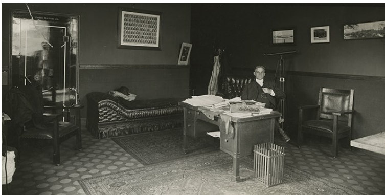
Henry Ford’s Piquette Avenue Office

Ford’s next revolution - a manufacturing revolution would play out over the next few years at Highland Park as the company developed the moving assembly line.