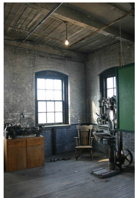
The experimental room as it is today.