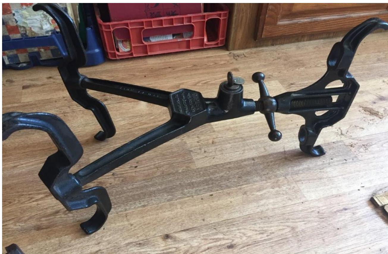
Adaptor to carry two spare wheels

AGM update, Committee reports, Cars for Sale, registration fees due, Melbourne Cup Weekend update and much more.