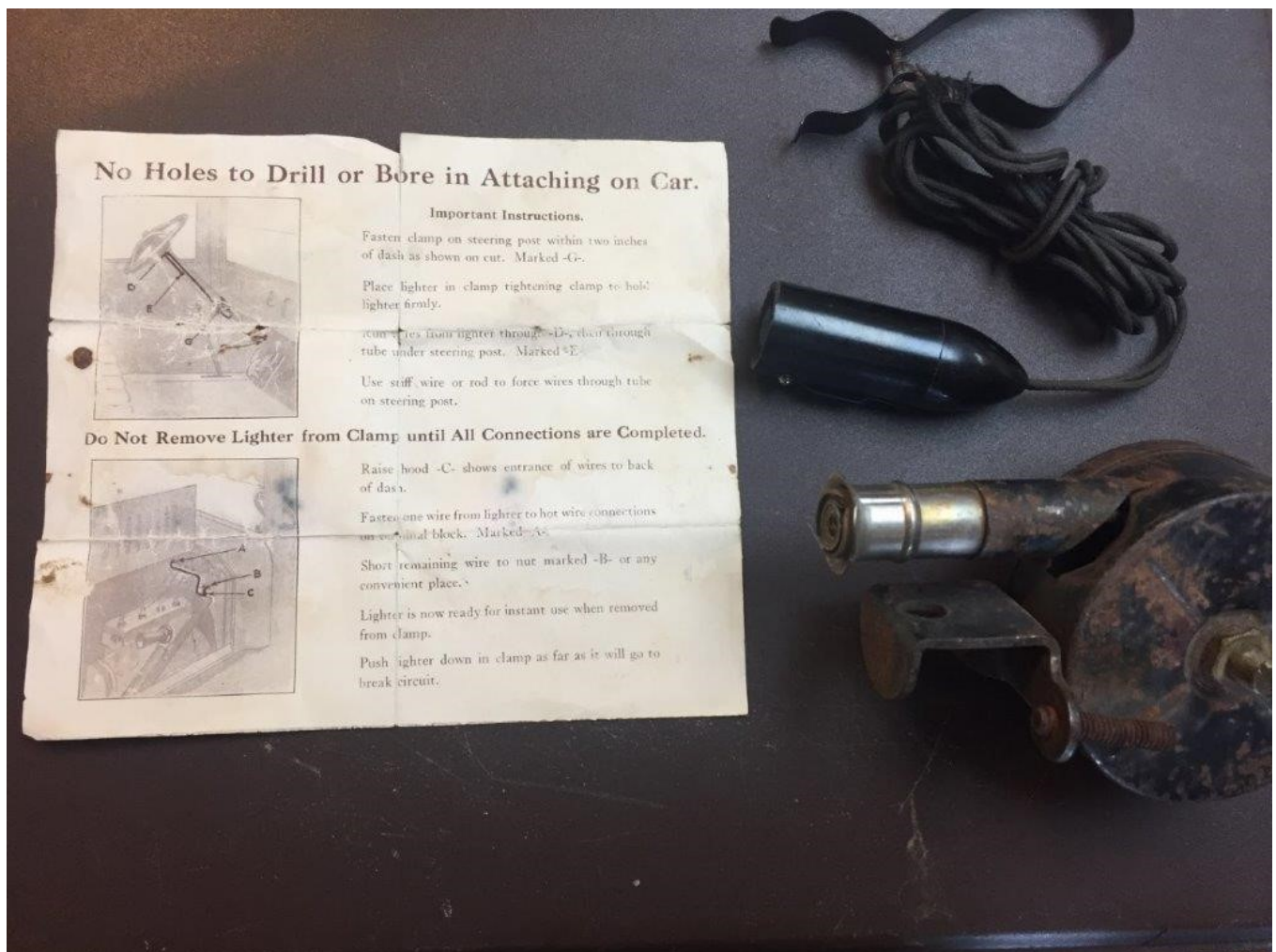
Cigarette lighter, pulls out from bracket and recoil return action. —How things have changed!