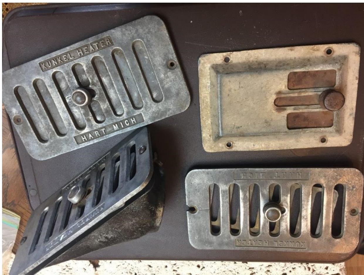
Car heater kits, fits around exhaust pipe.