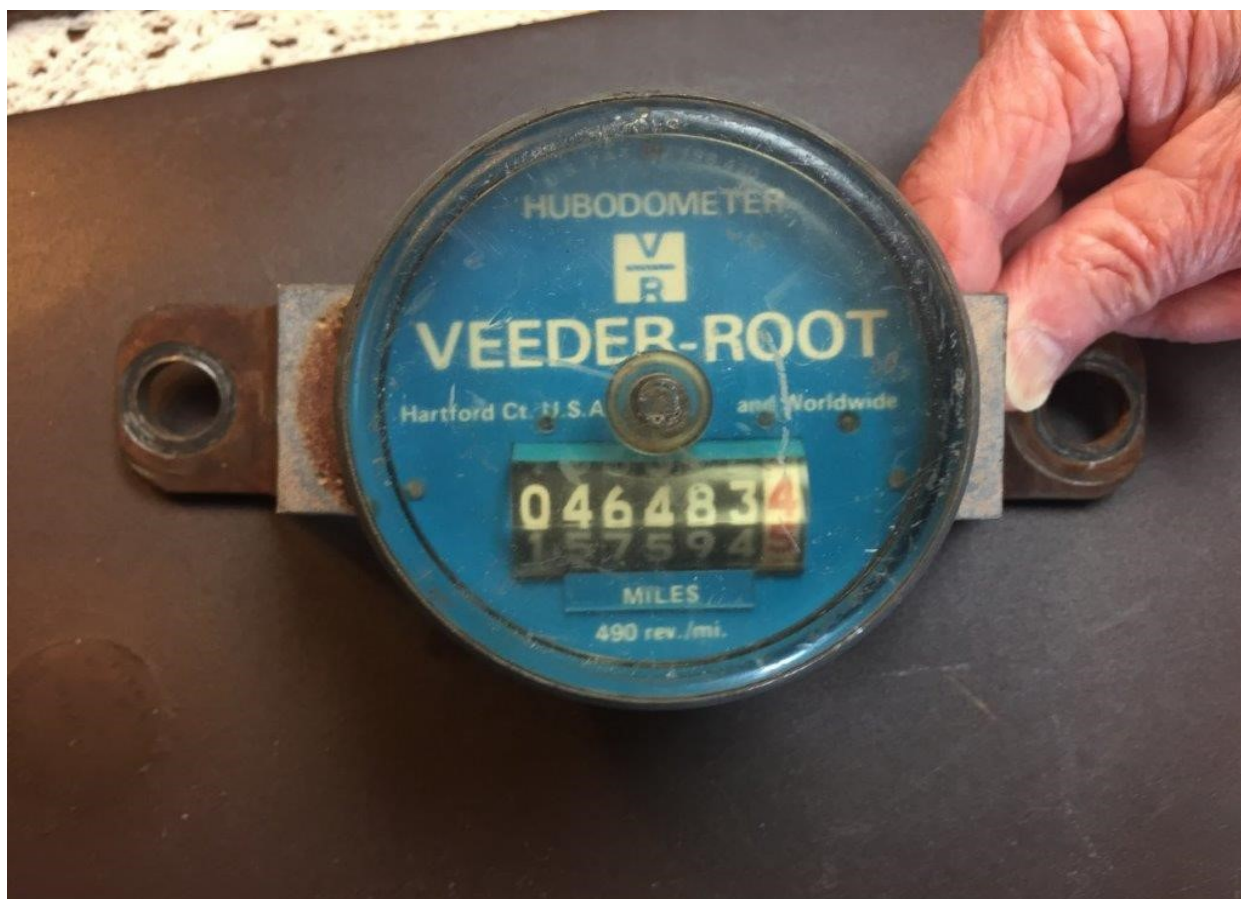
Hubodometer, clamps to wheel and measures distance travelled.