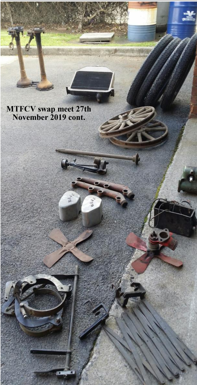
MTFCV swap meet 27th November 2019 cont.