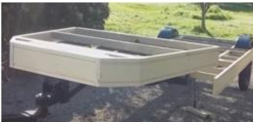
2The 5th wheeler Motorhome chassis